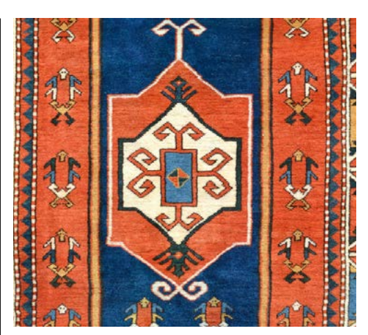
Fachralo prayer rug made in 2016/17 by ReWoven

Picturesque town overlooking the Alzani Valley with views across to the Greater Caucasus Mountains in the distance. Stroll the cobbled streets, take a horse ride to a local vineyard or relax in the hotel spa