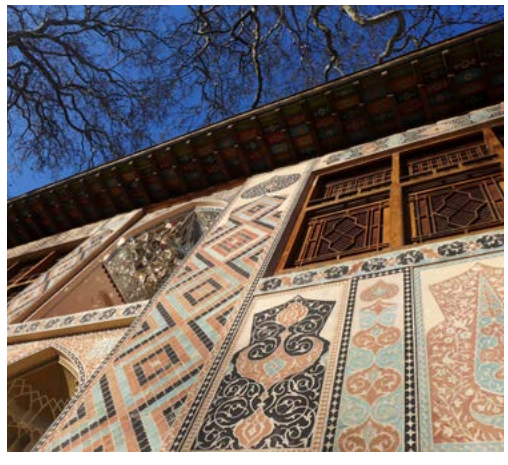
Sheki Khans' Palace

Historic village known for its cobbled streets and traditional craft studios, particularly copper work