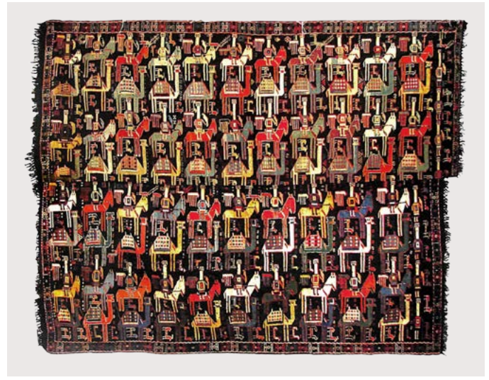
Shadda, Karabagh, 18th century, Simon Janashia National Museum of Georgia Collection, Tbilisi

In 2017 the HALI Tour to the Caucasus starts the day after the 5th International Symposium on Azerbaijani Carpets ends in Baku. The timing provides the perfect opportunity to share the knowledge and experience we have gained from HALI's two previous tours to the region.