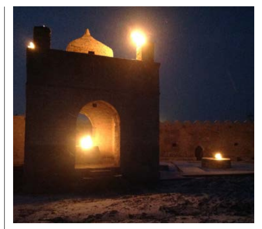
Ateshgah fire temple, Baku

HALI Tours represent the distillation of more than thirty-five years of HALI articles and the experience gathered through their preparation.