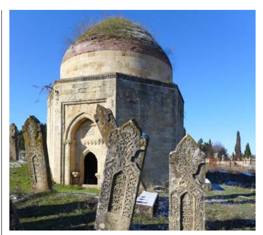
Yeddi Gumbaz Mausoleum

From Azerbaijan, Georgia and Russia, giving context to the complexity of the region's textile traditions