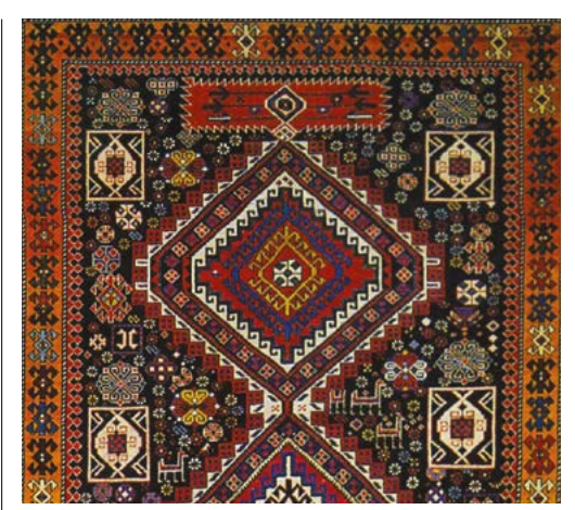
Shirvan, 19th century, Azerbaijan, Janashia NMG Collection, Tbilisi

Grapevines tumble over the balconies of historic buildings, red-tiled roofs mix with Soviet architecture, and winding narrow streets reveal cultural delights and opportunities to visit antique carpet shops