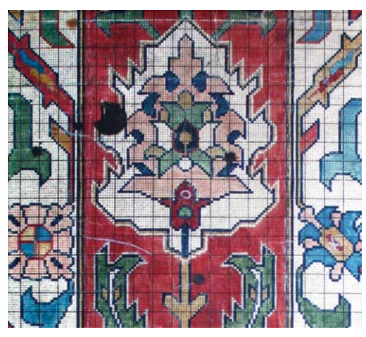
Point paper from the Straume archives, State Museum of Folk & Applied Arts

Dine in Soviet style grandeur at the Funicular Complex, first opened in 1905 atop the Mtatsminda Plateau, with panoramic views of the city