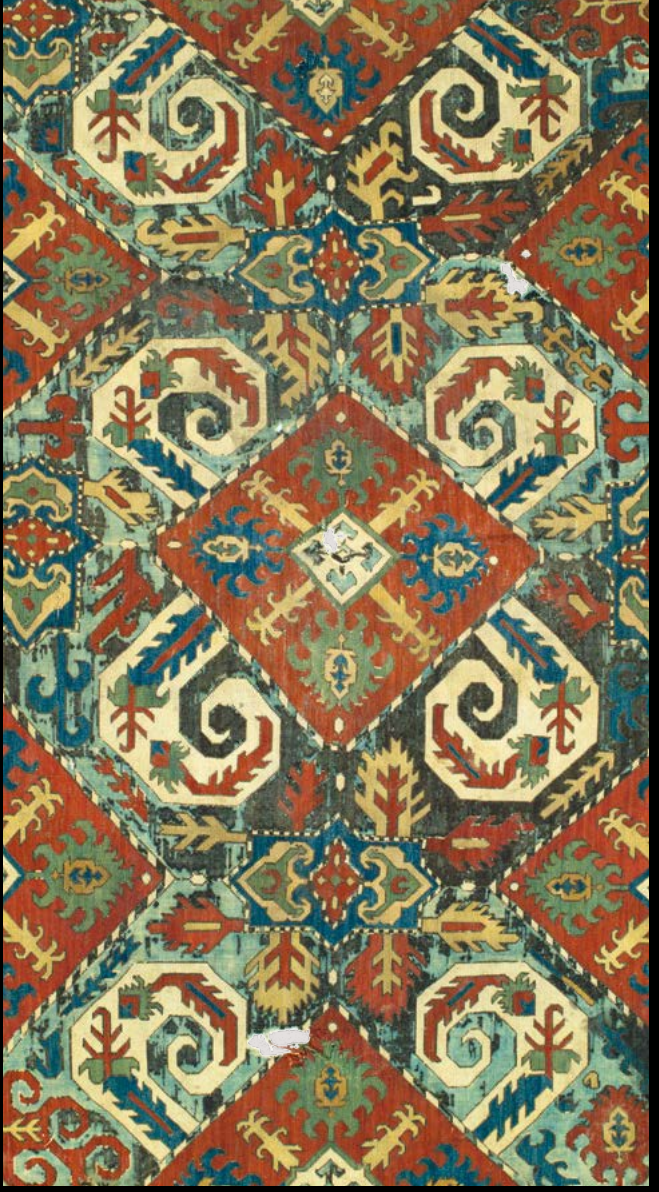
Silk cross stitch embroidery, 18th century, Azerbaijan National Art Museum, Baku